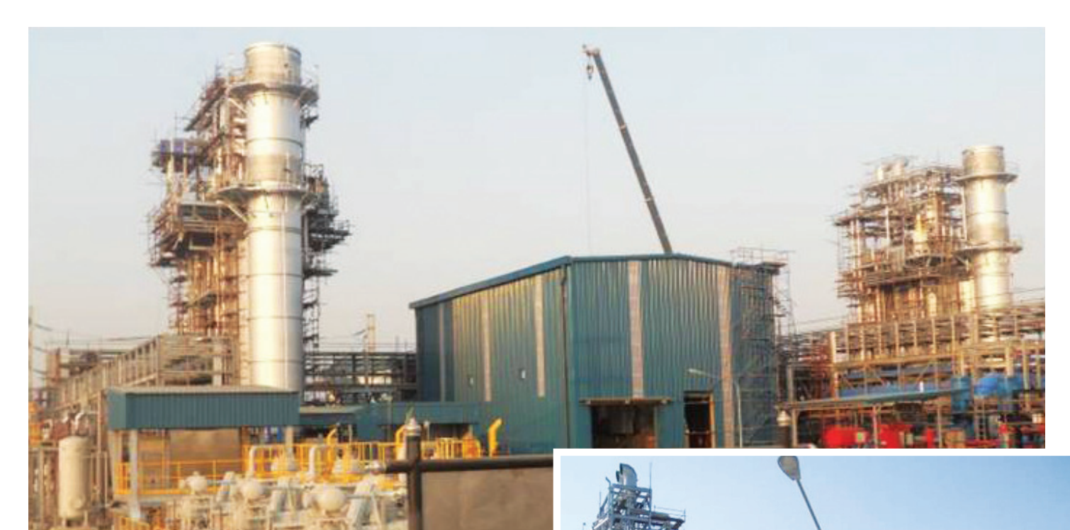
Overall View of the Rojana SPP2 Project

urong Engineering Limited was awarded two contracts by Rojana Power Co., Ltd in July 2010, namely the Rojana SPP2 Combined Cycle Power Plant Project and the Rojana Phase 5 Extension Project. They involve the Supply of BOP Equipments; Electrical and Piping; and total plant construction including Civil, Mechanical, Electrical and Piping works. The main equipment consisting of LM6000PD Gas Turbines, Heat Recovery Steam Generators and Steam Turbine was supplied by IHI.